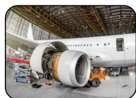
AEROSPACE & DEFENCE